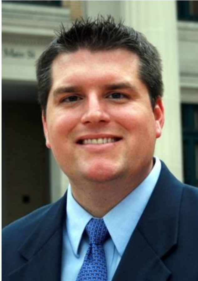
Lee County District 4 Commissioner